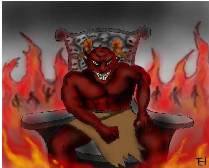
There is a cost for sin!

John 3:36 ናዓሢ ጉሙርቂ ዔከሢከ ናንጊና ናንጊ ዓኣኔ፤ ናዓሢ ጉሙርቂ ዔኩዎአሢ ጋዓንቴ ፆኦሲ ዲንጋ ሜቶይዳ ናንጋንዳኣፓዓቴም ከሺ ናንጊ ዴንቃዓኬ» ጌዔኔ።